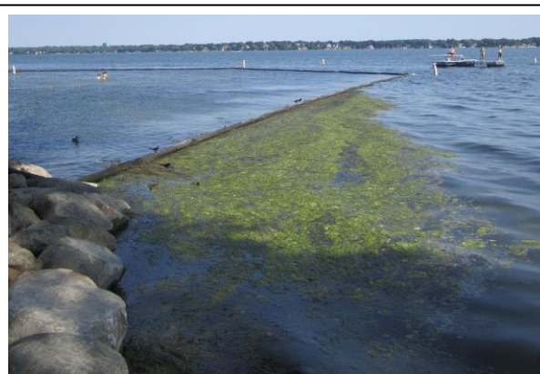
Fig. 6. Photo showing the deflector boom system preventing algae scums and other floating debris from entering the enclosed swimming area at B.B. Clarke Beach, June 2012.

Bernie's Beach. The deflector boom system deployed at Bernie's Beach (Fig. 8) during the summers of 2010-2011 maintained the swimming area relatively free of algal scums and other floating debris. Because of the more sheltered and restricted location of the beach area in the corner of Monona Bay, the two sidewall booms were attached to shore with outside wall angles only slightly greater than 90 degrees. Floating material was often observed trapped outside the corner of the west sidewall boom (Fig. 9).