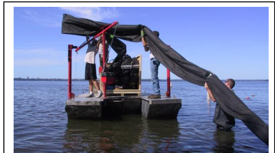
Fig. 4. Boom wall being unloaded from a barge, June 2012.

Each boom wall was constructed of 8 oz. Polypropylene Geotextile fabric. The boom wall’s flotation collar consisted of a series of 10-foot long styrofoam tubes (6-inch diameter) covered by a double layer of fabric for extra durability (Fig. 4). A hanging fabric curtain weighted with ballast chain extended one foot below the flotation collar to ensure good interception of floating debris in the lake while allowing water to circulate freely underneath the boom. This design prevented water from stagnating within the swimming area. During windy periods with strong waves and water currents, the curtain would “billow” sideways thereby reducing pressure on the boom wall. A stainless steel tension cable in the curtain directly underneath the flotation collar allowed each boom wall to be tightly stretched in a straight line between two anchoring points on the shoreline and/or in the water.