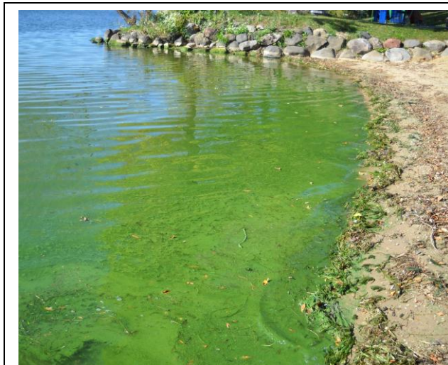
Fig. 2. Algae pile-up in the protected shoreline cutout at B.B. Clarke Beach, Oct. 5, 2010.

While the ultimate solution to blue-green algal blooms in the Yahara lakes is reducing the level of nutrients that fuel algae growth – efforts that are the centerpiece of past and ongoing watershed management programs – this pilot-scale project tested whether more limited measures could prevent scums and other floating debris from fouling public swimming beaches. To that end, experimental boom systems designed to prevent this fouling were deployed on lakes Mendota and Monona during the summers of 2010-2012. This report evaluates that 3-year experiment.