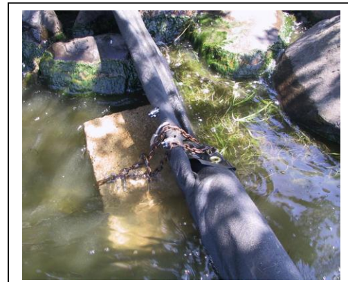
Fig. 5. Concrete block and chain used to prevent boom wall from being lifted out of lake at shoreline.

Because the shoreline attachment point was usually well above the waterline, the boom wall tended to lift out of the lake near shore. That problem was rectified by placing a heavy block at the water’s edge and chaining the boom’s tension cable downward to the block at a point right next to the edge of the first floatation tube (Fig. 5). A 5-ft piece of geotextile curtain fabricated on each sidewall boom’s shore end helped ensure a tight seal at the shoreline to prevent floating debris from leaking into the swimming area.