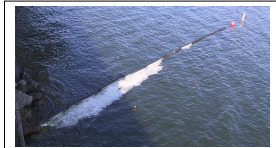
Fig. 14. Floating material trapped on the single boom deployed at UW Center for Limnology in 2010. (Photo: R. Lathrop,

Single boom test (UW-Madison shoreline). The single boom tested at the UW Center for Limnology shoreline in 2010 (Fig. 14) was deployed with a 60 degree angle on the west side of the boom to trap material coming from that direction. However, floating material occasionally became trapped for short periods on the obtuse-angled side of the boom wall; material was rarely trapped on the boom side facing University Bay. While large scums did not occur in Lake Mendota during 2010, this test demonstrated that a single boom could intercept and temporarily trap floating material especially along shorelines subjected to long-shore currents.