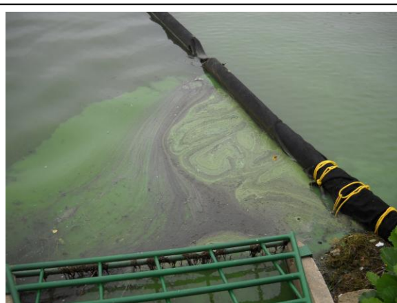
Fig. 9. Algae scum and other floating debris trapped outside the sidewall boom at Bernie's Beach, July 2010.