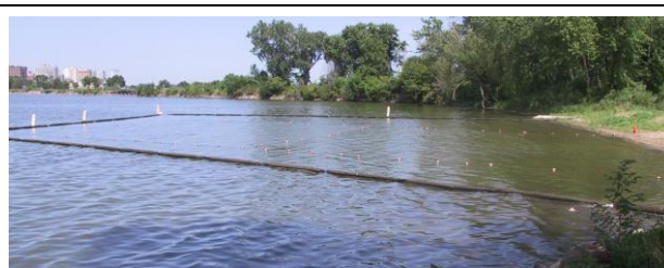
Fig. 8. Deflector boom system deployed at Bernie's Beach, June-August 2010-2011.

Throughout much of the summer, Olin Beach appeared to get very little use as filamentous algae piled up on the edge of the beach's sand shoreline. During one period in July, the two sidewall booms were unhooked and tied to the endwall boom so that canoes and kayaks could be launched from the beach area. Only one water monitoring event took place at this site, yielding low algal densities and no detection of microcystin. The deflector boom was removed in mid-August prior to a recreational event.