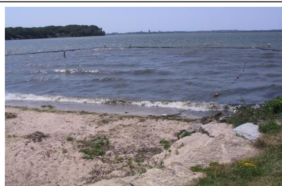
Fig. 11. Deflector boom system deployed at Warner Beach in 2012.

If park personnel had the capability to suck out this suspended material, then the deflector boom system at Warner Beach could be beneficial. Otherwise,