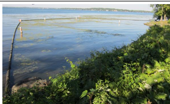
Fig. 10. Deflector boom system deployed at Olin Beach in 2012 showing aquatic plants and filamentous algae growing inside and outside the boom system.