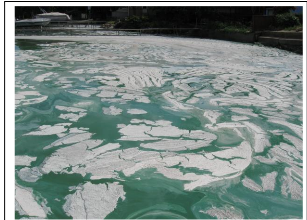
Fig. 1. Blue-green algal scum on the Yahara lakes. (Lake Kegonsa, June 2012)

Although algal blooms often form throughout the lake’s upper well-mixed waters, some species of blue-green algae have gas vacuoles that cause the algae to rise towards the water surface when winds are relatively calm to obtain more light for photosynthesis. Water currents from moderate winds then push the buoyant algae to downwind shorelines where the algae can pile up as thick mats or scums along with other floating debris such as cut aquatic plants (“weeds”), detached globs of filamentous algae, dead fish, and trash.