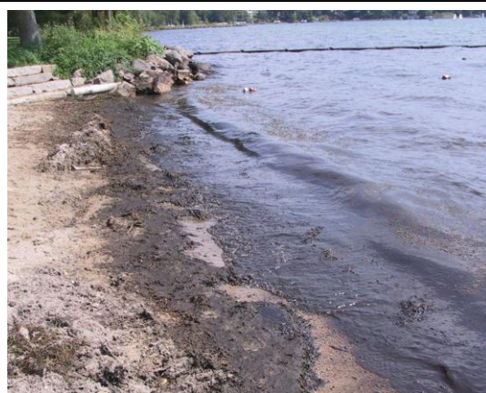
Fig. 13. Suspended debris in the water and on shore inside the deflector boom system at Warner Beach in late July 2012.