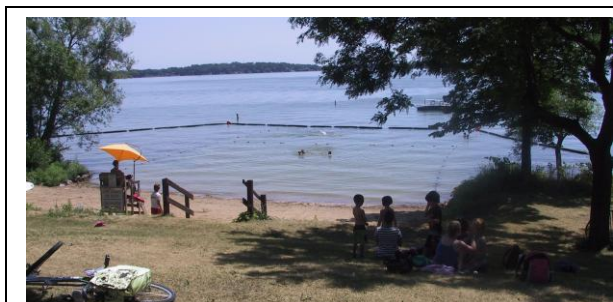
Fig. 3. Three-sided, trapezoid-shaped deflector boom system deployed at B.B. Clarke Beach during June-August 2010-2012.

Boom system design. Each boom system consisted of three individual boom walls connected to form three sides of a trapezoid surrounding a beach’s swimming area (designated by floating ropes) with the much wider “base” of the trapezoid being the park shoreline extending beyond each side of the sand beach (Fig. 3). Thus, the shorter endwall boom of the trapezoid was deployed parallel to shore just beyond the roped swimming area. The two longer sidewall booms were designed to ideally attach at the park shoreline with an approximate 120-degree angle on the outside